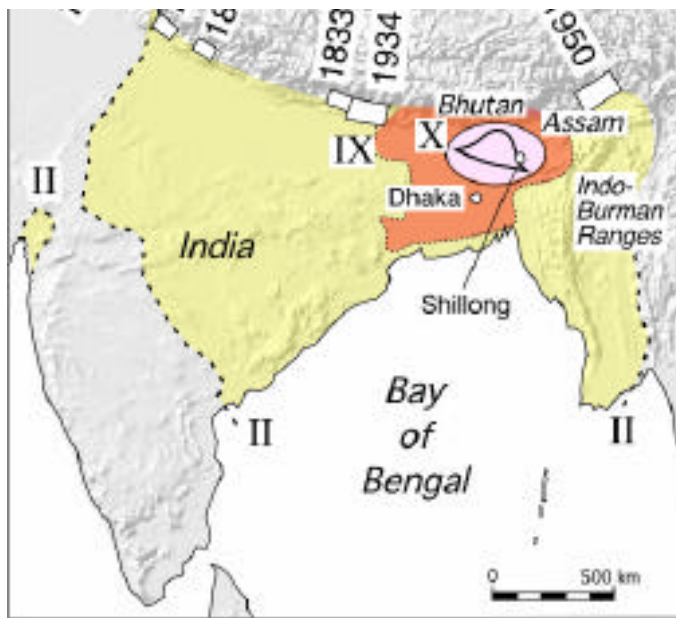
Figure 1. Area shaken by the 1897 Assam Earthquake and location of major Himalayan ruptures in the past 200 years 30 . Masonry structures were damaged within Oldham's 1 intensity IX contour, and destroyed within the Intensity X ellipse. The earthquake was felt by persons within the Intensity II region. The orientation of the curious "mexican-hat" shape of the epicentral region mapped by Oldham corresponds to the strike of the causal subsurface rupture derived from geodetic data (Fig. 2).

The results of the surveys are available as the locations of points 7,8 with their apparent post-seismic displacements, calculated holding fixed two points within each network 1,6,9,10 . We seek the values of these parameters that best fit the observed angle changes. The absence of scale and orientation information permits only the analysis of angular changes 11,10 , which we derive from these published data. We treat the angular changes as though they reflect deformation of an elastic half-space, distorted by slip on a single rectangular plane representing the 1897 earthquake. In doing this we neglect deformation caused by other earthquakes between 1860-69 and 1897 and by post-seismic deformation before the re-surveys.