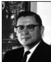
NATHAN M. NEWMARK

(1912-1999) Formerly Vice-Chancellor University of Roorkee India