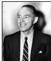
H. BOLTON SEED

Professor (Emeritus) University of California, Berkeley, USA